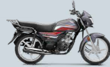
Geny Grey Metallic