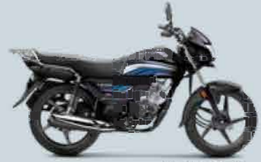
Black with Blue