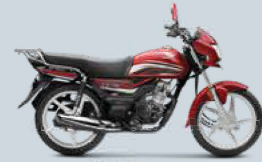
Imperial Red Metallic