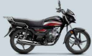
Black with Red