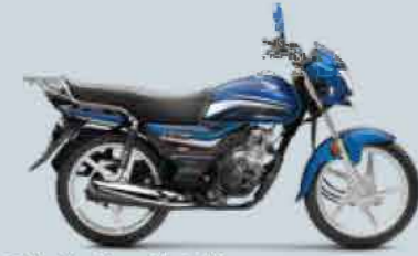
Athletic Blue Metallic