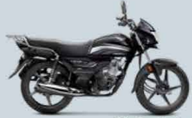
Black with Grey