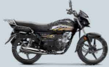
Black with Cabin Gold